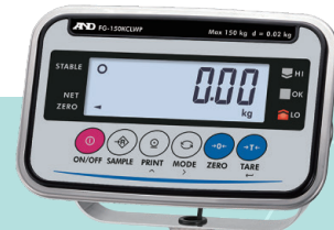
L-size platform (60 kg / 150 kg)