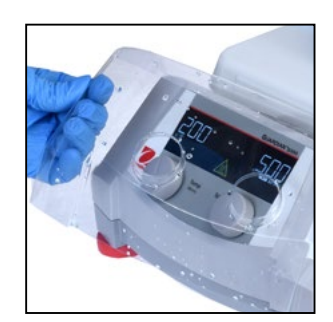
In Use Cover