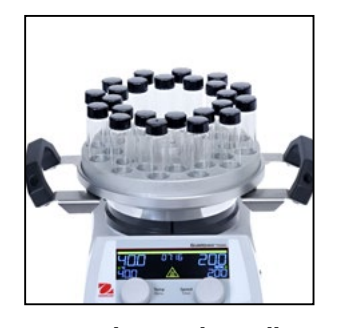
Base Plate and Handles