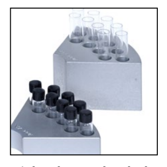
Vial and Test Tube Blocks