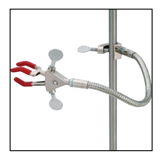
Ultra Flex Support Kit