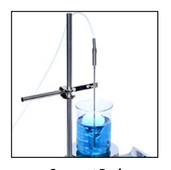
Support Rod and Clamp Kit